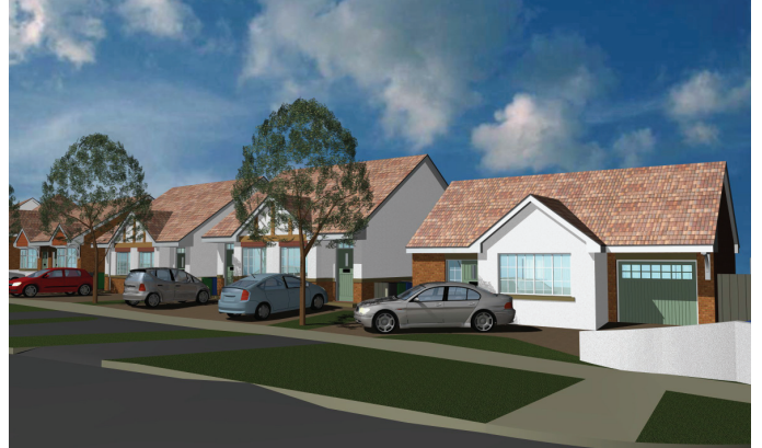
Street View Plots 8 - 14