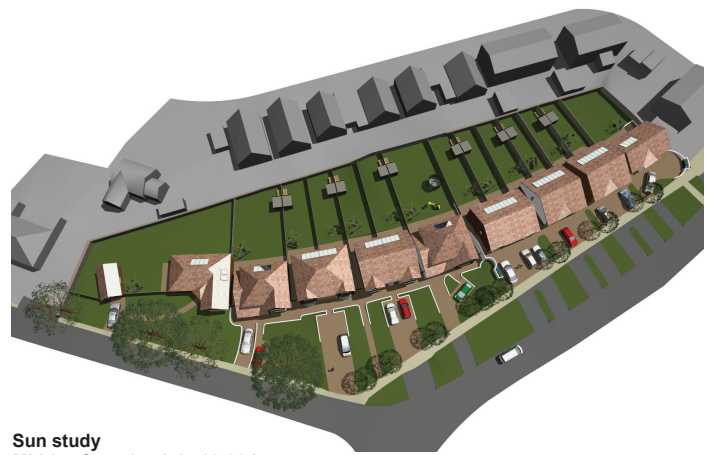
Sun study Midday Sun; 1st July 12:00 hrs