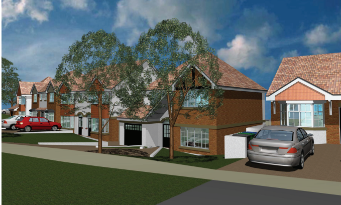
Street View Plots 2 - 7