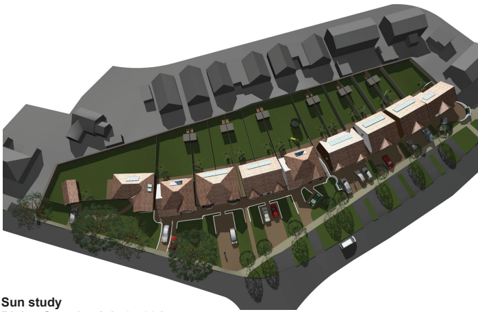
Sun study Rising Sun; 1st July 07:30 hrs