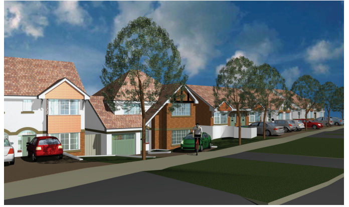
Street View Plots 5 onwards