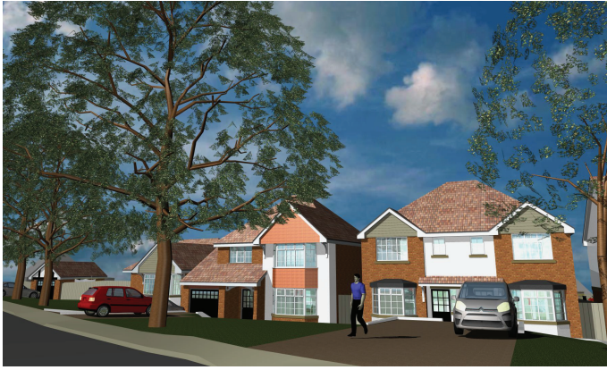
Street View Plots 1 - 4